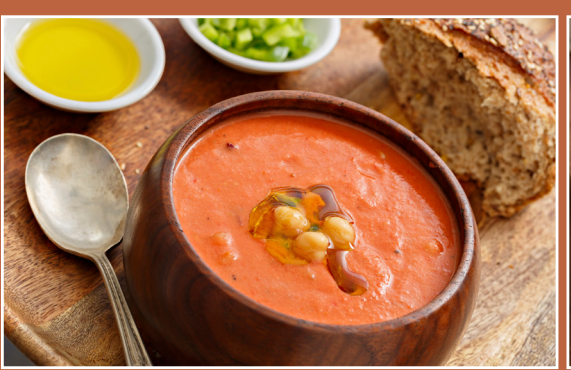
Soup Du Jour Roast Turkey or Vegetarian Turkey Gravy Bread Dressing Green Beans Artisan Breads Apple Brown Betty