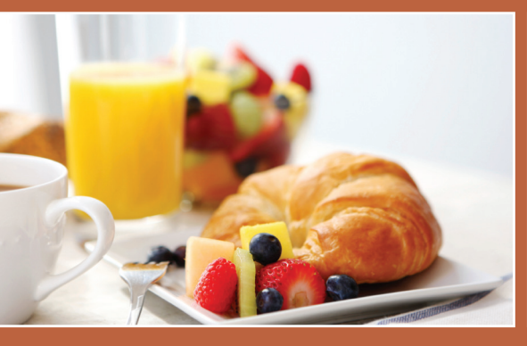
Cold Cereal or Oatmeal Eggs to Order Seasonal Fresh Fruit Sausage Gravy Biscuits