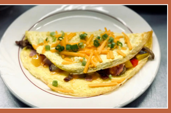
Cold Cereal or Oatmeal Omelet to Order Seasonal Fresh Fruit Sausage Gravy Biscuits