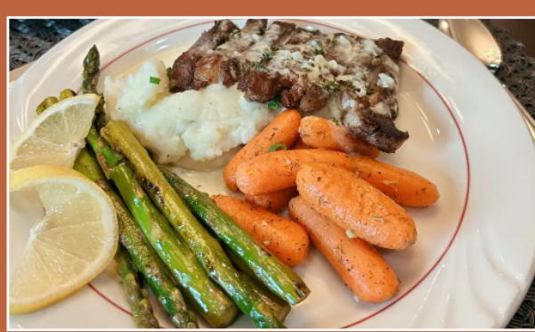
Ribs Mashed Potatoes Roasted Carrots Sauteed Asparagus