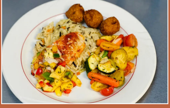
Baked Fish with Fruit Salsa Wild Rice Roasted Vegetables Hush Puppies