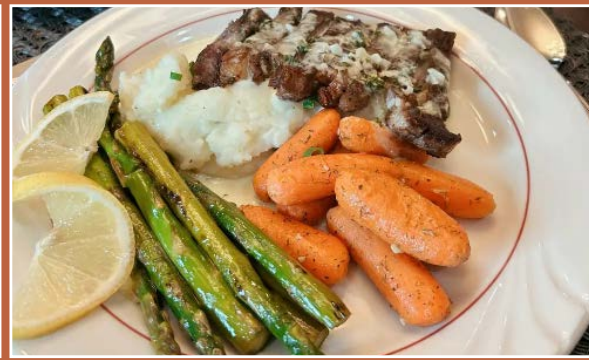
Ribs Mashed Potatoes Roasted Carrots Sauteed Asparagus