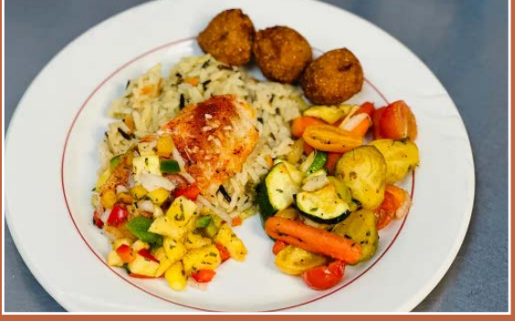
Baked Fish with Fruit Salsa Wild Rice Roasted Vegetables Hush Puppies