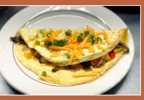
Cold Cereal or Oatmeal Omelet to Order Seasonal Fresh Fruit Sausage Gravy Biscuits