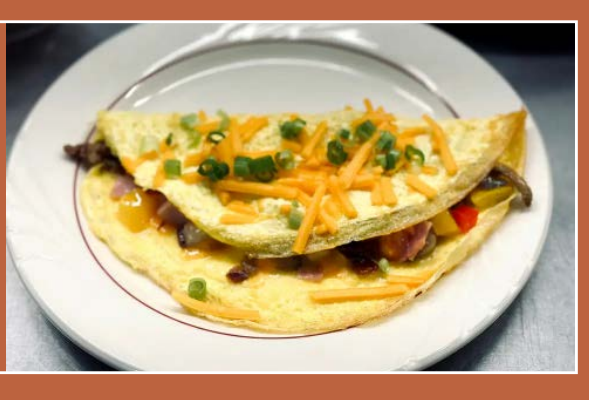
Cold Cereal or Oatmeal Omelet to Order Seasonal Fresh Fruit Sausage Gravy Biscuits