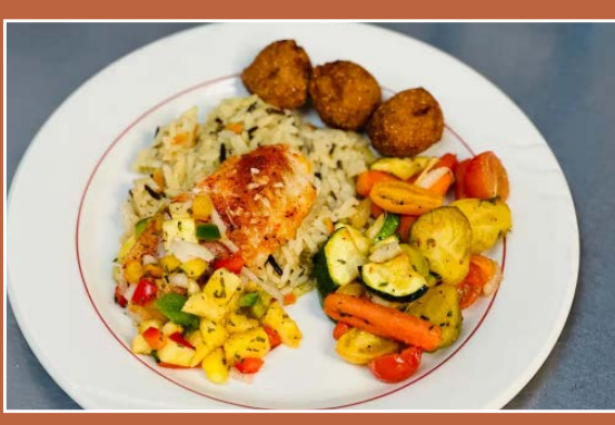
Baked Fish with Fruit Salsa Wild Rice Roasted Vegetables Hush Puppies

Ribs Mashed Potatoes Roasted Carrots Sauteed Asparagus