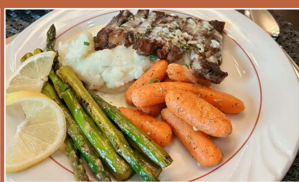
Ribs Mashed Potatoes Roasted Carrots Sauteed Asparagus