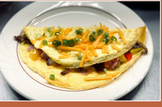
Cold Cereal or Oatmeal Omelet to Order Seasonal Fresh Fruit Sausage Gravy Biscuits