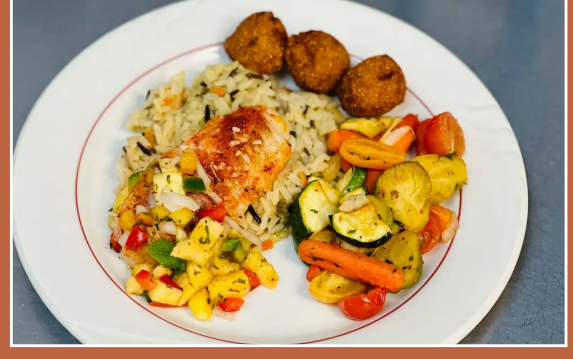
Baked Fish with Fruit Salsa Wild Rice Roasted Vegetables Hush Puppies