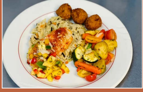
Baked Fish with Fruit Salsa Wild Rice Roasted Vegetables Hush Puppies