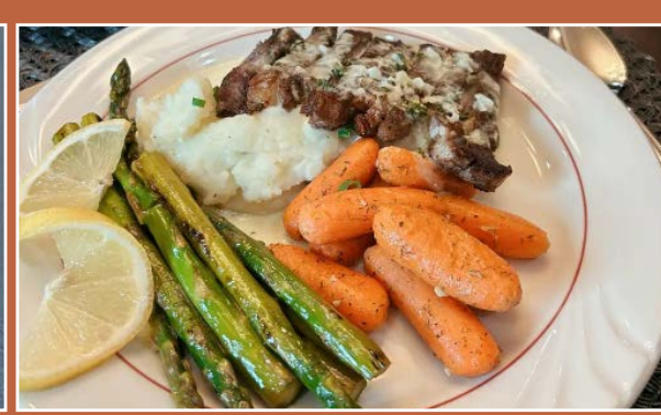
Ribs Mashed Potatoes Roasted Carrots Sauteed Asparagus