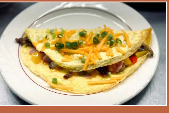
Cold Cereal or Oatmeal Omelet to Order Seasonal Fresh Fruit Sausage Gravy Biscuits