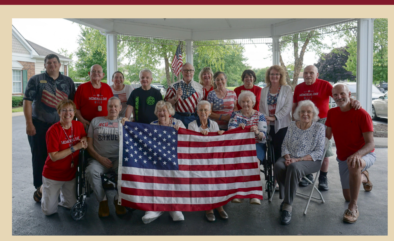
HAPPY 4TH OF JULY FROM MORNING POINTE OF FRANKLIN ASSISTED LIVING & ALZHEIMER'S MEMORY CARE