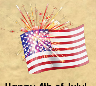
Happy 4th of July! - From Morning Pointe

We hope you are enjoying the summer as much as we are! Coming up in July as we continue with our Patriotic theme; celebrating 4th of July, then on to the festivities at the Johnson County Fair. Look for us in the Parade on July 14th! Later in July we invite you to our annual Luau -Mark the date -Thursday, July 26th at 5:00 pm!